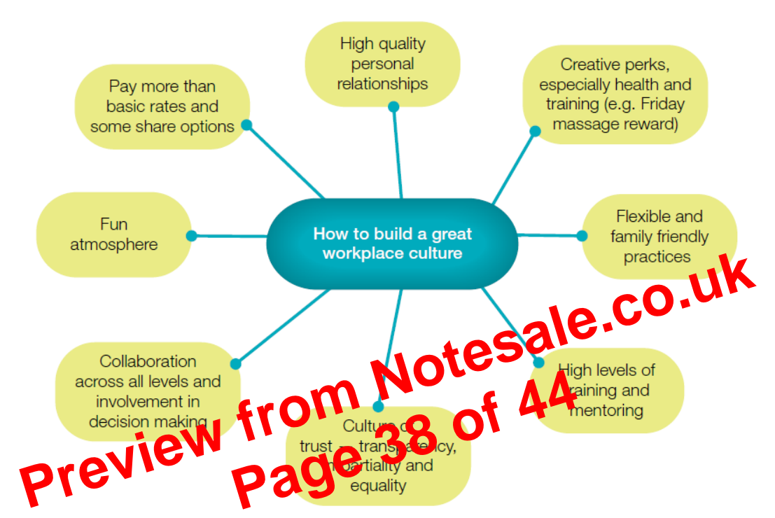
FIGURE 17.3 How to build a great workplace culture — features of workplaces rated the best in Australia

These problems are reflected in poor business performance, lower sales, lower profits than competitors and ultimately the 'bottom line.'