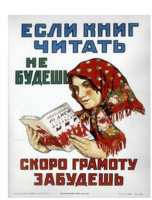
Figure 16: This poster states that if you don't read books, you will forget the grammar. This symbolises the extensive propaganda campaign against illiteracy