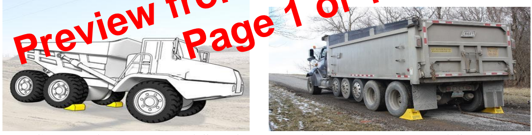
TRUCK IN DOWN HILL POSITION