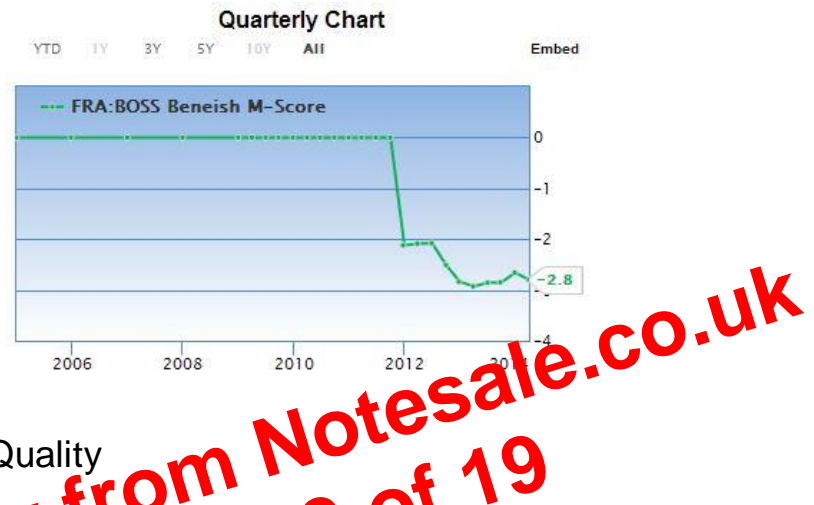
Figure 5: M-Score Hugo Boss