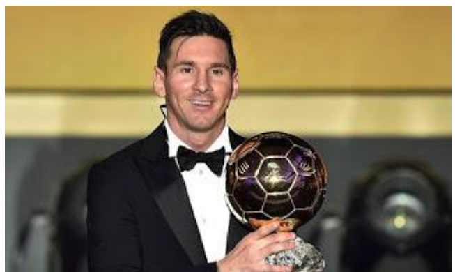
Daily GK Update - Current Affairs - 13th January 2016

for best goal of the year, for his bicycle kick goal for Goianesia against Atletico-GO in March 2015.