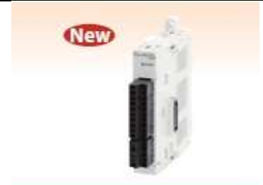
Figure 10: Analogue O/P