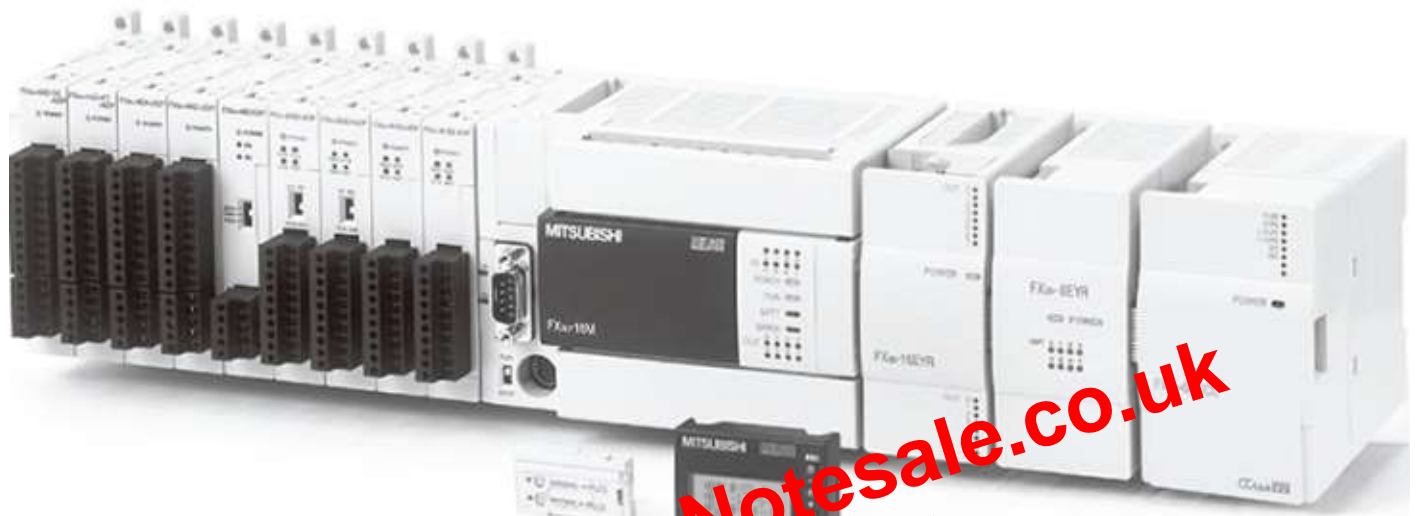
Figure 1: FX3U PLC (centre) with Special Adaptors (left) and Special Function Blocks (right)

A Compact PLC has the processor, power supply and I/O all contained within one unit. Traditionally these were called Unitary (or Fixed) PLCs. They were small, cheap and had no facility for future expansion, so they were only suitable for tasks that would not change in the future. They were generally used for simple control tasks, usually mounted next to the machine / process they were controlling. Today's Compact PLCs are more powerful, and have some scope for expansion. Modern Compact PLCs still have a processor, power supply and I/O all contained within one unit. Extra I/O, communications, A/D, D/A or other specialised control would be performed via expansion units connected to the main unit. The most basic Compact PLCs may only accept one or two expansion units, while high end units can have a dozen or more additional units attached.