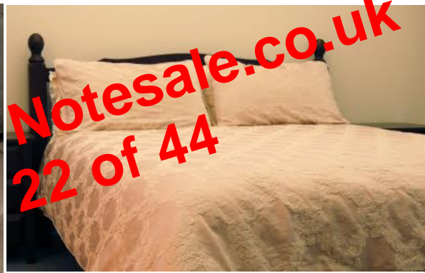
There are two pillows on the bed.