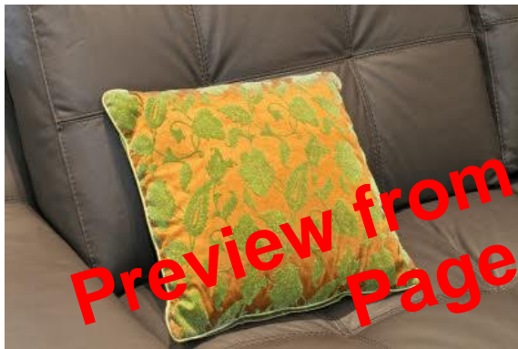
There's a pillow on the sofa.