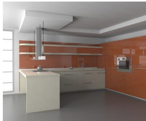
Are there any chairs? No, there aren't.