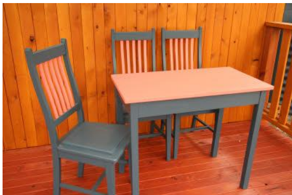
Is there a table? Yes, there is.